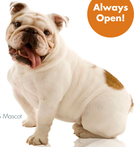
Wilson, AES Mascot

"Compassionate 24-hour emergency & specialty vet care for your best friend!"